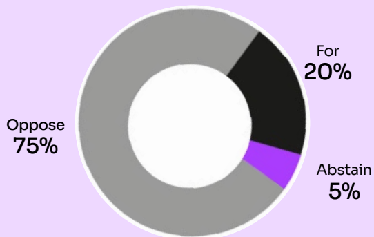
Auditor appointments, Q4 2021