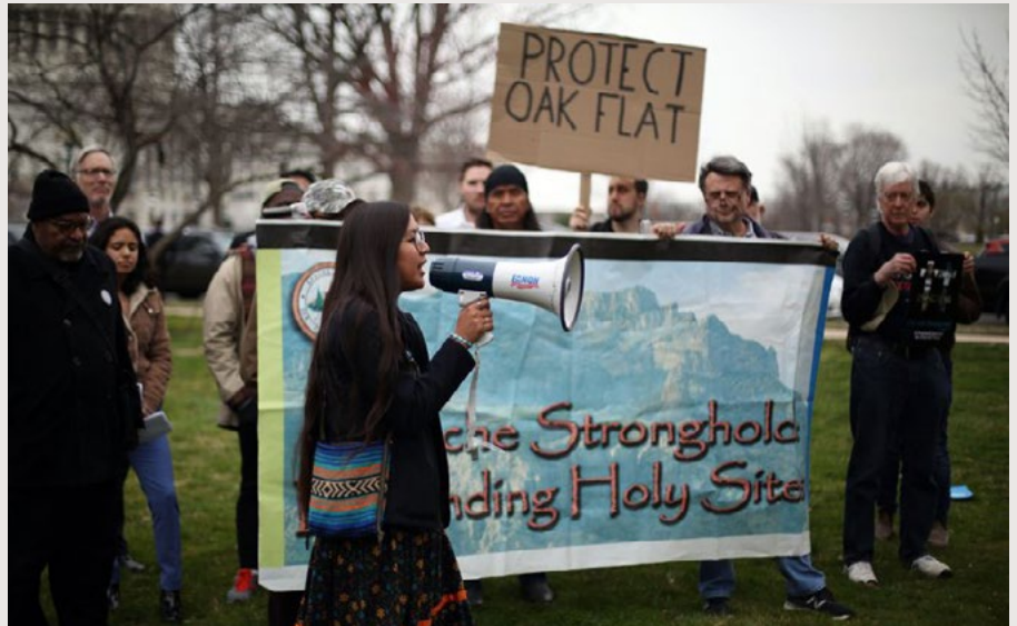
BHP joint venture Resolution Copper project with Rio Tinto in Arizona

Outcome and follow up: A meeting in December sought for publication of a more granular report on lobbying with a trade association overview as well as information on the shareholder consultation for a transition plan to be put to the 2022 AGM.