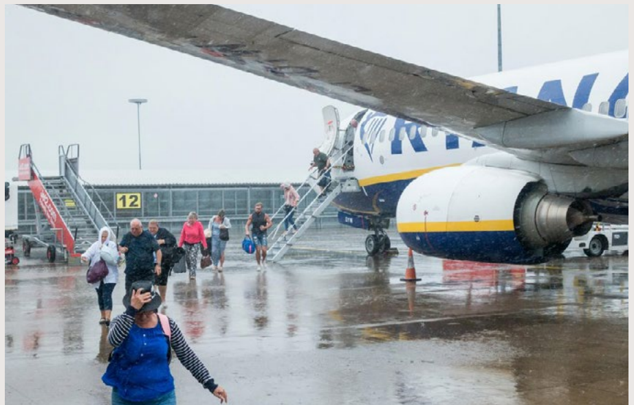
Ryanair at Leeds Bradford Airport

Engagement: In November, the pool met with the company to discuss its approach to mitigating human rights risks within its supply chain. The company provided an overview of its human rights due diligence processes. These included conducting a human rights impact assessment globally on a biannual basis. The company outlined that assessments serve to identify potential areas of risk, capture emerging risks in relation to new operations and projects, and review or develop mitigation plans as required. The company further outlines that it