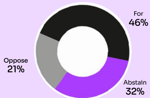
Votes on remuneration binding, Q4 2021